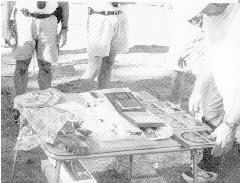
Left - The Table 'o Loot, showing individual and team trophies and the pile of stuff raffled off at the end of the contest.