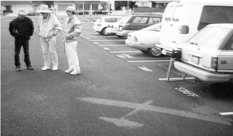
Flying the Phantom - February's contest was cut short by rain.....