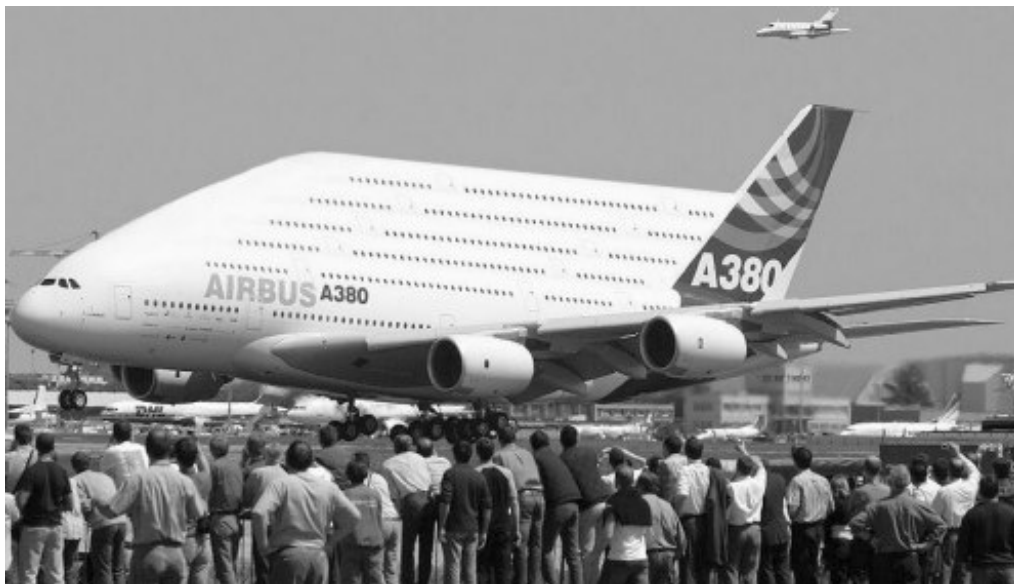
Finally: Here is a picture of the new Airbus A380-500 (the stretched version of the A380) that someone mailed to me

A light menu, some sandwiches, a lot of talk about just about everything related to flying and some stuff that was nothing to do with flying.