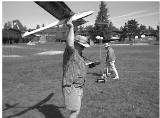
(A couple of pictures from the contest courtesy of Larry's new digital camera. ("See - it really does work....."))