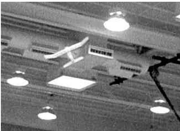
It really is very difficult to snap these models in flight. (Right) Myles demonstrating the use of

The last Friday in April was our first opportunity to try out the new gym at Redwood for indoor flying. It proved to be OK apart from the air conditioning which we couldn't figure out how to turn off. We were allowed to fly in there provided we had footwear that didn't mark the floor and we flew lightweight (<2oz) models that were either unpowered or powered by rubber. If there is sufficient interest (and someone — anyone — can figure out how to turn the A/C off) then we can get the gym on the last Friday of each month. The school is cooperative because this activity is viewed as educational. Flying these light models is both an art and a lot of fun. They require careful trimming and the fly very slowly. The rubber motors rotate the propellor maybe two or three times a second and the models fly at barely walking pace..