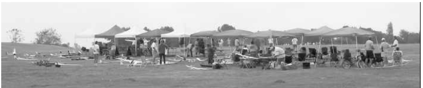
One of Gary's Pictures — the rest are on Page 4 EDSF and Visalia Results are on Page 5

Anyway, we finished up with the ten minute portion of the contest and the TOSS members got their planes back in one piece to boot. TOSS scoring sprinkled through the ranks, placing 2nd, 13th, 22nd, and 38th. All in all a great place to fly with decent grass, great weather, BBQ and refreshments, and this was followed by a Hand Launch Contest as well. I have enclosed a couple of photos to share with the other club members - just to give a feeling for what the place is like. This is a good place to fly for novice competition flyers what with few obstacles to intimidate.