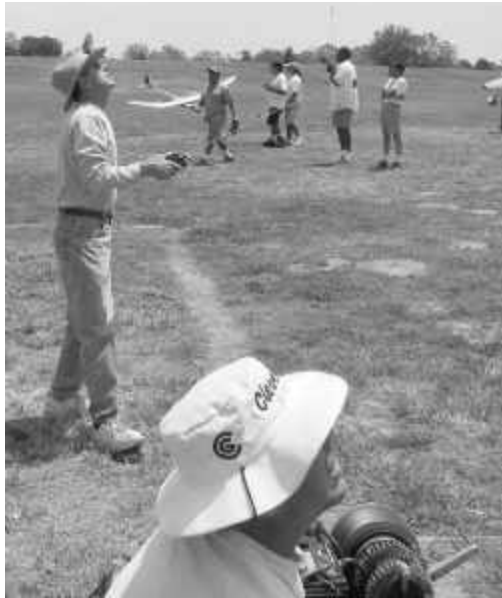
More of Gary's Pictures from EDSF