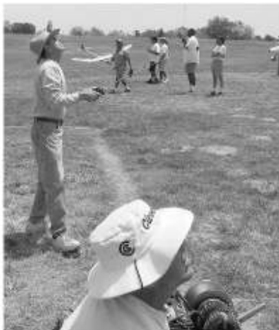
More of Gary's Pictures from EDSF