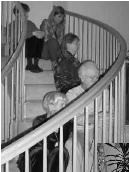
Overflow crowd .....