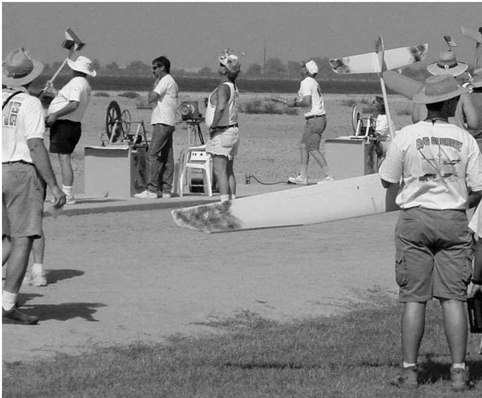
The launch area at Visalia showing the winch and retriever setup — both are on stands. (Picture from CVRC's Website)

For all of us who were there, we will be waiting for next year to try to be the best again.